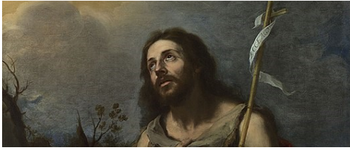
The Birth of John the Baptist (Luke 1:57-66)

Now the time came for Elizabeth to be delivered, and she gave birth to a son. And her neighbors and kinsfolk heard that the Lord had shown great mercy to her, and they rejoiced with her. And on the eighth day they came to circumcise the child; and they would have named him Zechari'ah after his father, but his mother said, "Not so; he shall be called John." And they said to her, "None of your kindred is called by this name." And they made signs to his father, inquiring what he would have him called. And he asked for a writing tablet, and wrote, "His name is John." And they all marveled. And immediately his mouth was opened and his tongue loosed, and he spoke, blessing God. And fear came on all their neighbors. And all these things were talked about through all the hill country of Judea; and all who heard them laid them up in their hearts, saying, "What then will this child be?" For the hand of the Lord was with him.